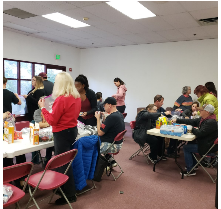
Martin Luther King Jr. "A Day of Service" at TUMC on January 20, 2025